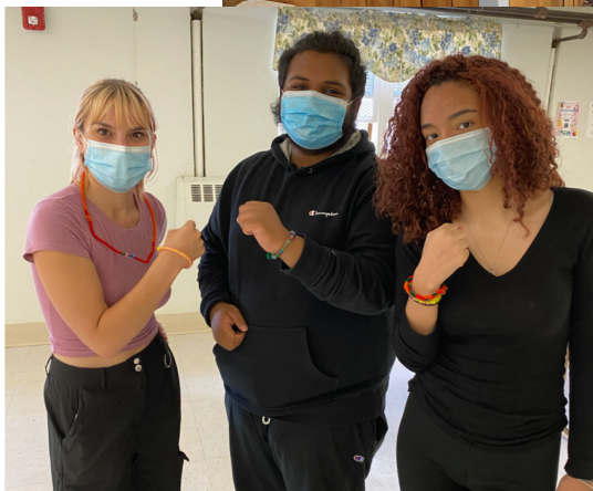
Left: Youth mentors from Kids in Community in Lynn