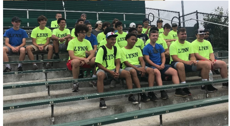
Below: Youthworks participants from the City of Lynn

MassHire Youth Career Center is working a hybrid model due to the pandemic. If you need to reach any of us, please find our contact information below: https://tinyurl.com/youthcareercenter